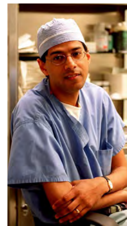
The documentary follows surgeon Dr. Atul Gawande as he shares stories of people and families confronting terminal illnesses, including his father.